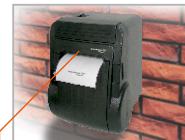
Hung on the wall

Convenient space-saving, The printer can be hung on the wall.