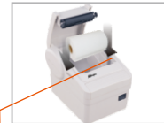
Easy paper loading

Easy paper loading designing and support big size paper roll.